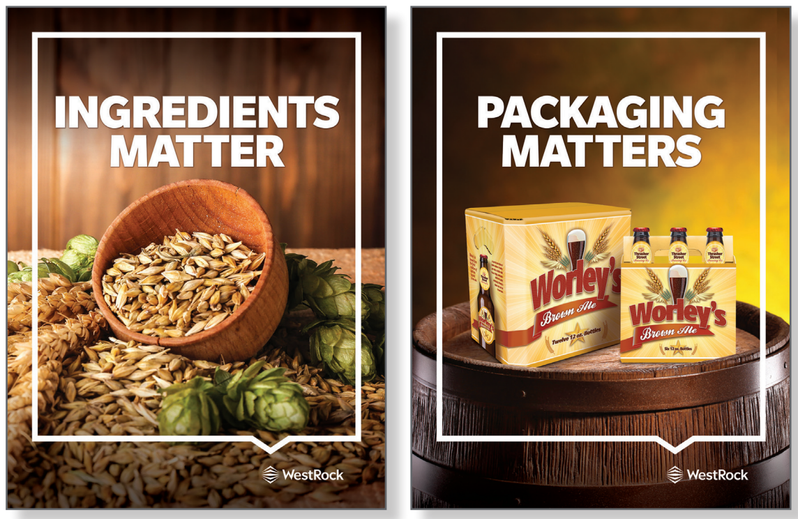
Conference Room Posters