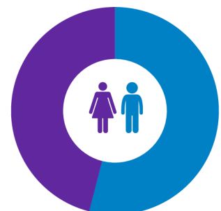
CLUB MEMBERS BY GENDER

83% White 10% Two or More Races 3% Black or African American 3% Hispanic or Latino 1% Some Other Race