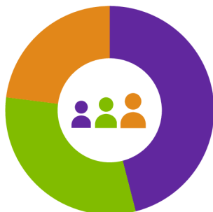
CLUB MEMBERS BY AGE

46% Youth (5-9) 31% Tweens (10-12) 23% Teen (13 and up)