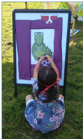
Redlees Park Fun Day