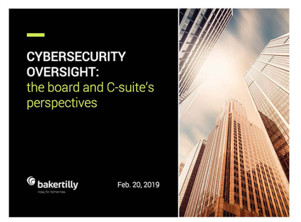
WATCH: On demand webinar about board governance over cybersecurity.

Learn more about cybersecurity risk management.