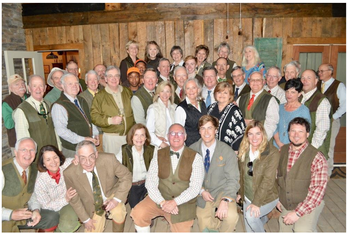
PAGE 3 OF 21