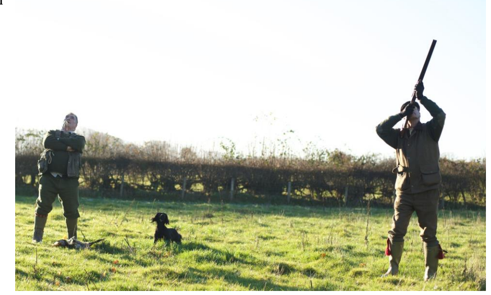
Bob Holliday in Action

shooting is excellent with challenging and sporting birds, but it is not the super-high birds often written about, which require special experience and practice. The bags each day also were not "high-volume" but everyone had plenty of shooting. This is a great trip for anyone looking for their first taste of driven shooting, or for the experienced shot who simply wants everything taken care of so he can show up and