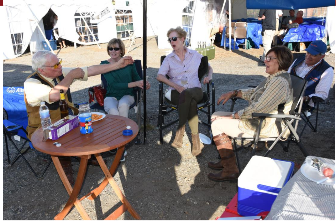
PAGE 19 OF 21