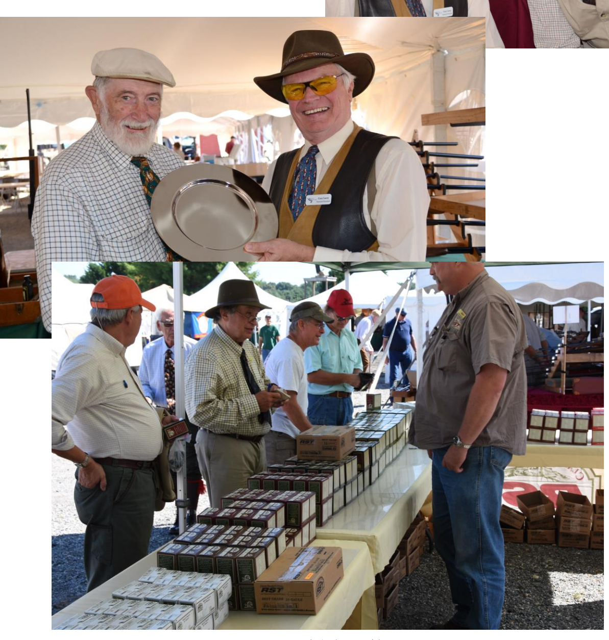
PAGE 17 OF 21