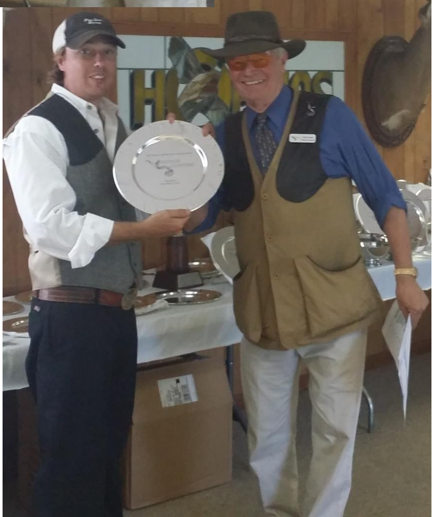
PAGE 5 OF 20