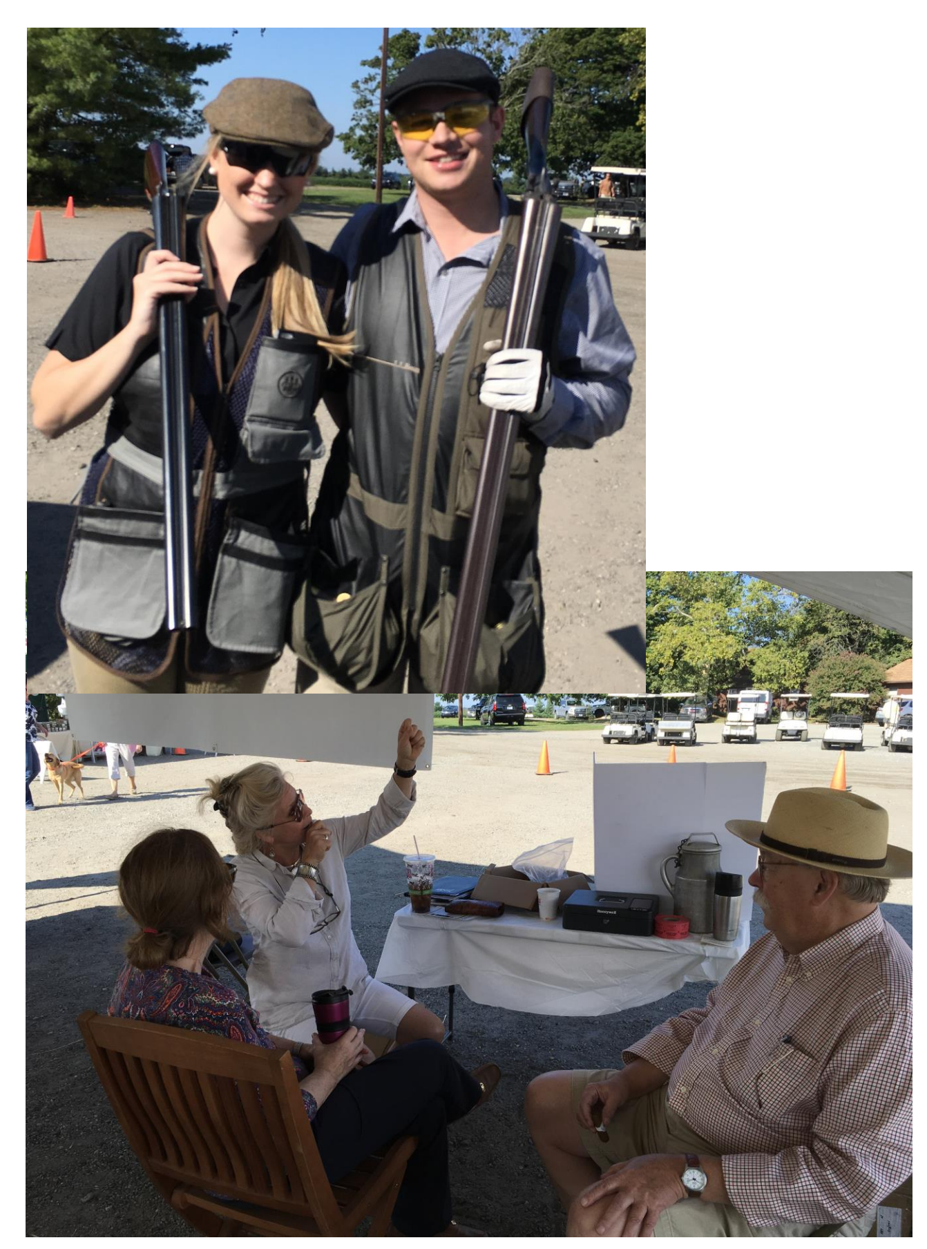
PAGE 3 OF 20