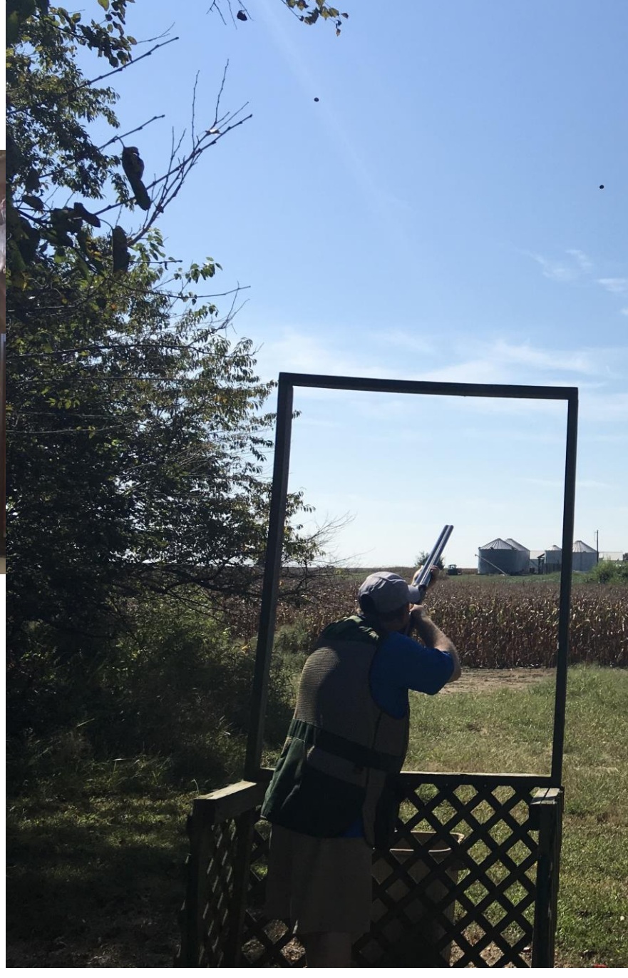
PAGE 6 OF 20