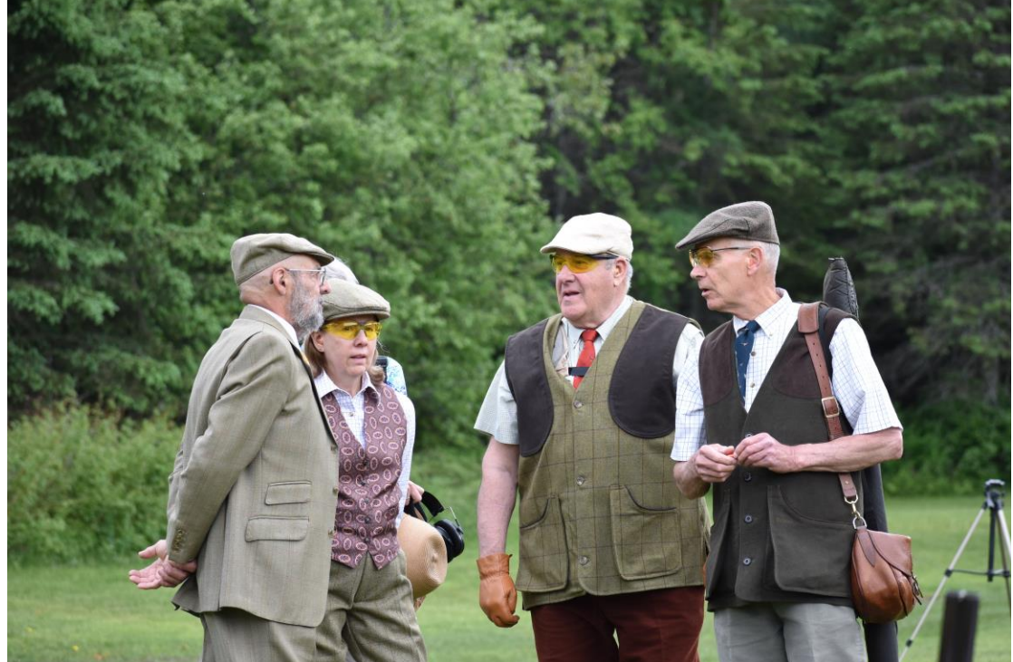
PAGE 3 OF 19

were in abundance and both ladies and gentlemen enjoyed a great day of sport. A black tie dinner on Saturday evening at the Foggy Goggle Osteria put the capstone on a wonderful event of shooting and camaraderie.