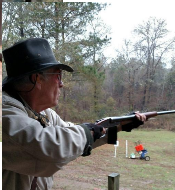
Carolina Vintagers Christmas Shoot