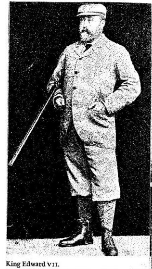
King Edward VII.