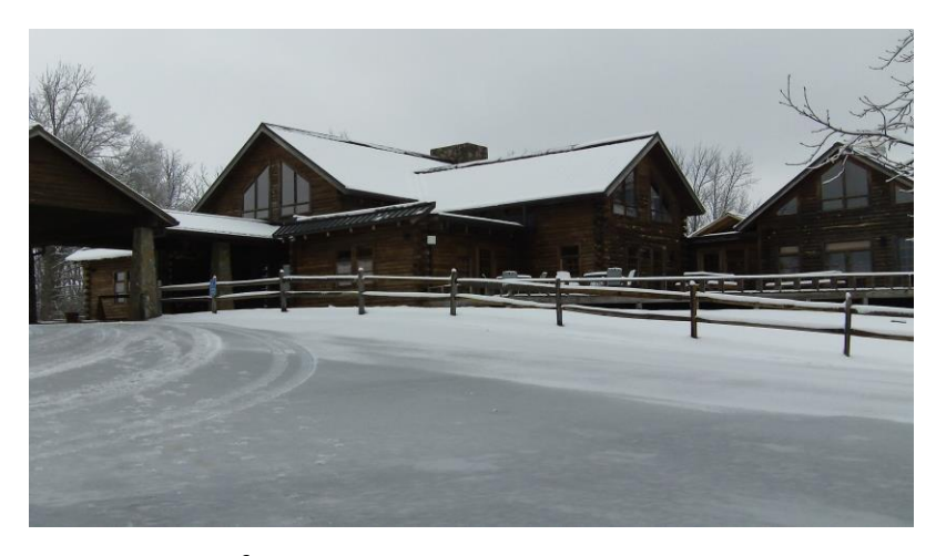
Page 5 of 12

A group of Carolina Vintagers decided to spend the weekend at River Bend. We recall the group arriving for lunch and we shot a round of sporting clays. As fate