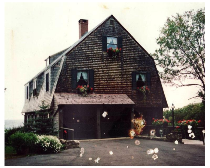
The photo to the left shows the street side of the Brambles as a stand-alone cottage (1990's)