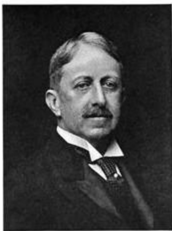
FRANCIS LYNDE STETSON, ESQ., New York City.

Francis Lynde Stetson (April 23, 1846–December 5, 1920) was an American lawyer. He was graduated from Williams College in 1867 and from Columbia Law School in 1869. He was admitted to the bar in 1869 and practiced in New York City. He devoted attention chiefly to corporation and railway law, becoming eminent in those lines. He became general counsel of the International Mercantile Marine Company, the Northern Pacific Railway, the Southern Railway, and the United States Rubber Company; also director in several railway companies and other corporations. In 1894, he formed the firm of Stetson, Jennings & Russell (a predecessor to the modern-day Davis Polk & Wardwell), which represented J. P. Morgan's United States Steel Corporation; he was also Morgan's personal attorney. President Grover Cleveland was a partner in the firm between his two terms as President, and a close friend. Stetson also served as counsel for Samuel J. Tilden in the controversy over the 1876 presidential election. He was president of the New York City Bar Association from 1910-1911. (Source: Wikipedia)