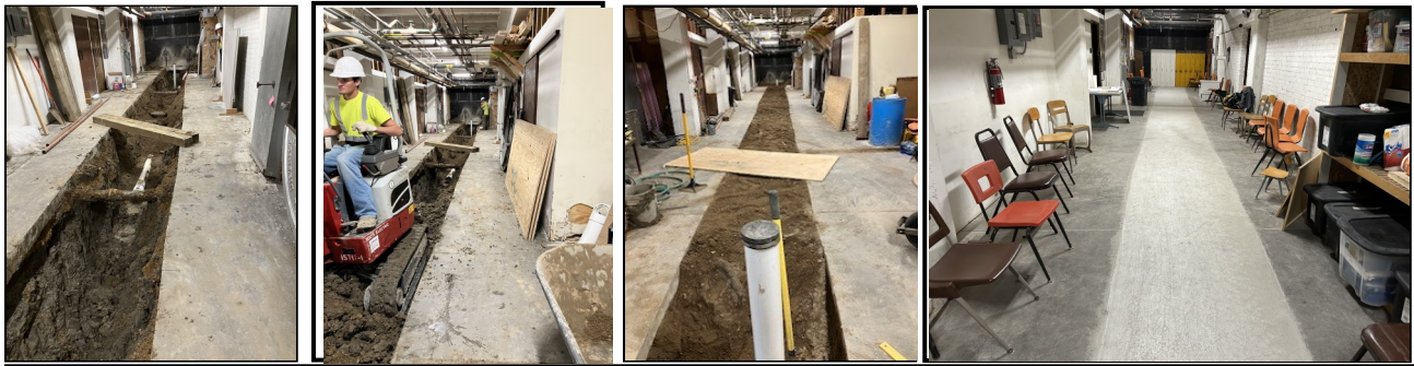
Digging and finishing the trench for the sanitary sewer line for the AB building. It runs north/south and was well done.