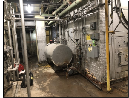
Condensate and plumbing