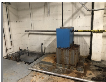
The old Backus condensate return