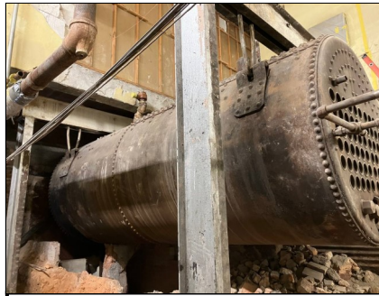
The first tank exposed