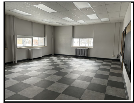
Room 104 flooring

Dreams and plans that endured a long season of waiting came to fruition for Backus with the closing of the sale of the Alexander Baker building in August of 2023. Life is being restored to AB, and Backus was finally positioned to seriously pursue necessary and significant operational and environmental improvements. We are all looking forward to the future for both historic buildings.