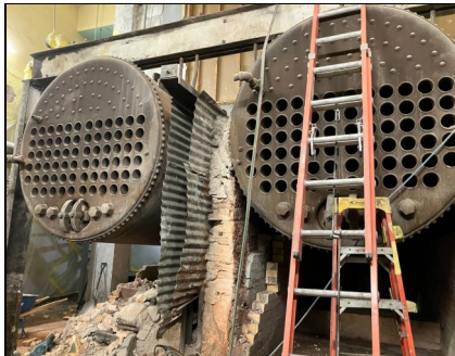
Removing the housings