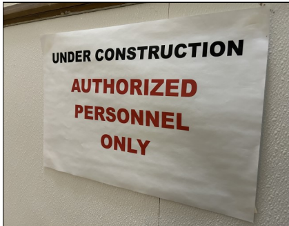
The work begins