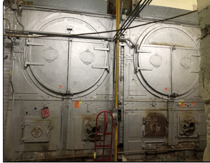
1912 Low pressure steam boilers