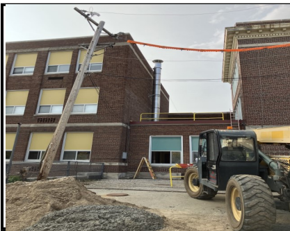
Stack for the new boiler system