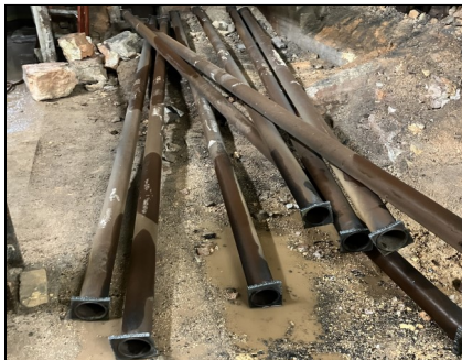
Tubes were in excellent condition