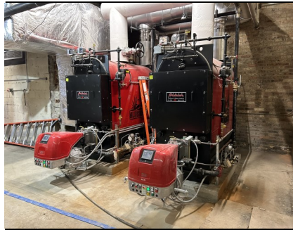
New Backus steam boilers