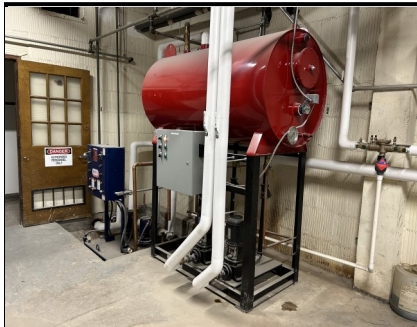
New Backus condensate system