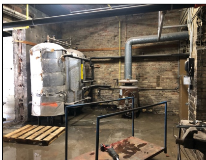
The old Backus water heater system