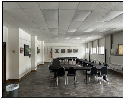
Room 101 flooring