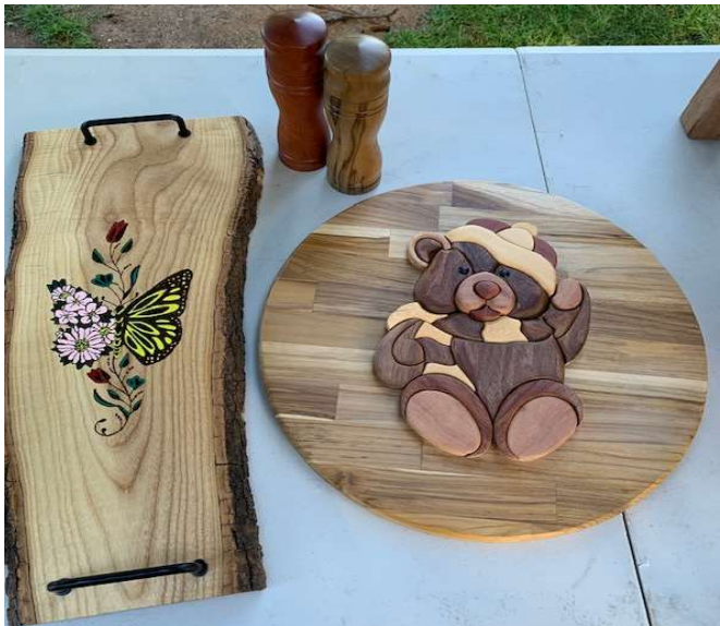
Figure 5 L to R – 4 th prize Charcuterie Board, 5 th prize Salt & Pepper Shakers and 2 nd prize the Intarsia Teddy Bear