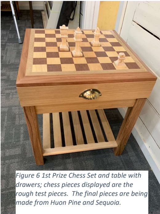
Figure 6 1st Prize Chess Set and table with drawers; chess pieces displayed are the rough test pieces. The final pieces are being made from Huon Pine and Sequoia.