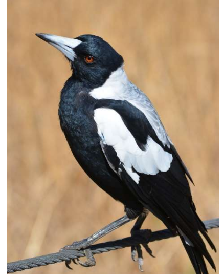
Figure 7 Did you hear our resident magpie supporter (Beau) moved to Magpie Street! Now that's fanatical!