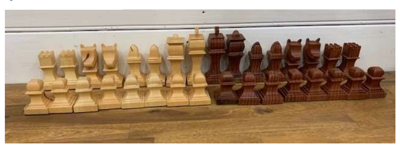
Figure 2 2nd Heather Pascoe – compound cut chess set in Huon Pine & Sequoia