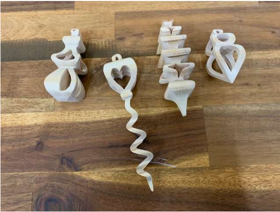
1 st & 2 nd compound cut ornaments by Heather Pascoe