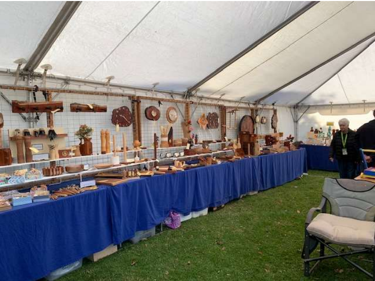
Figure 14 Cheryl does a walk through