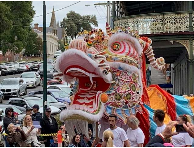
Figure 5 Dai Gum Loong coming down View Street