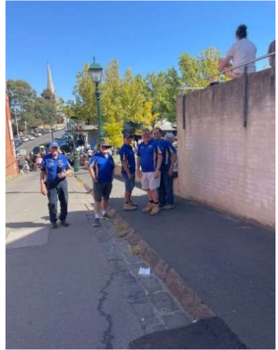
Figure 6 the Boyz