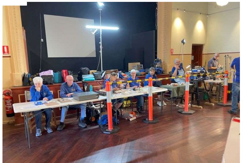
Figure 4 the A Team ready to go!