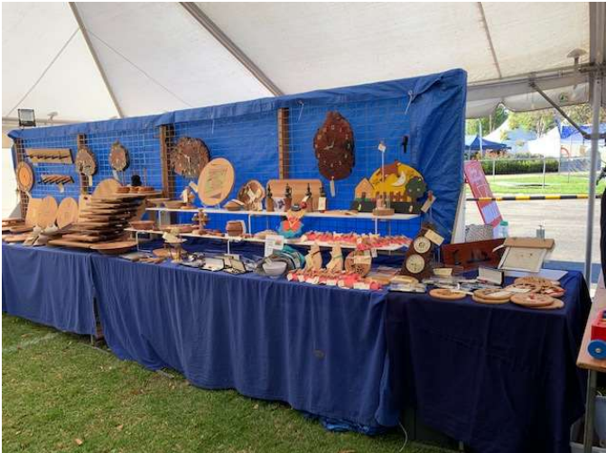
Figure 13 Ready to go!