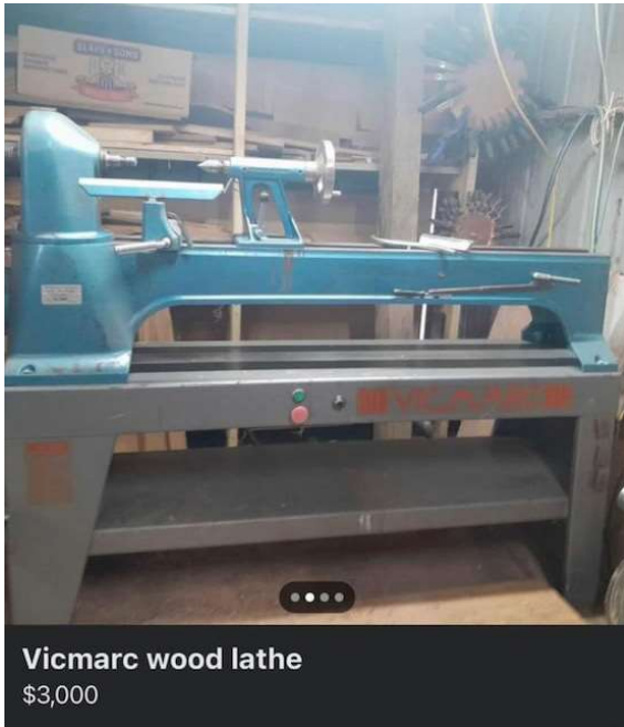
Vicmarc wood lathe $3,000