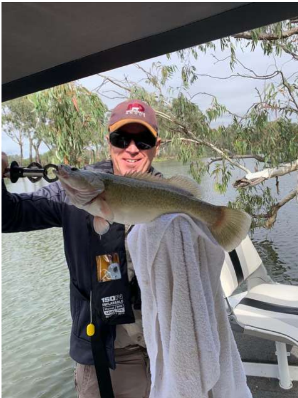
Our fearless leader 'Captain Cod'