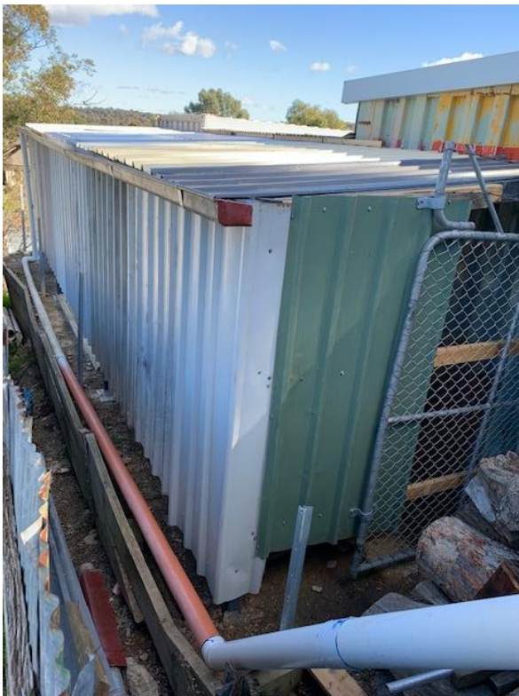
View from back street