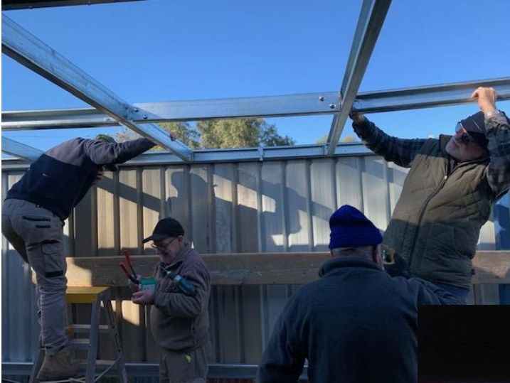
New drying shed