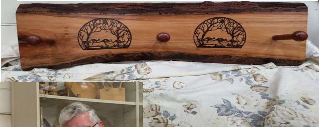
Figure 6 Coat hanger by Pyrography Group