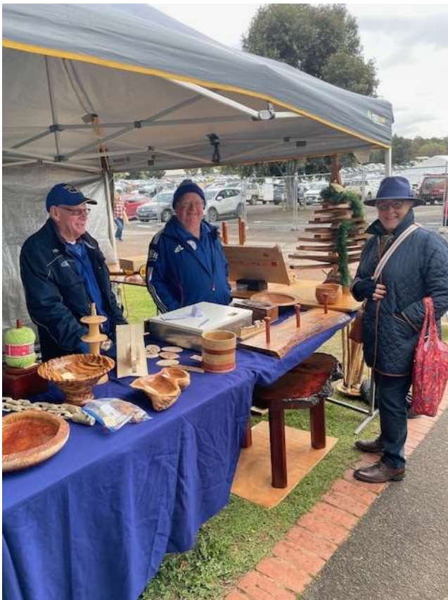
Figure 5 Raffle Sellers - they even sold my walking kangaroo!