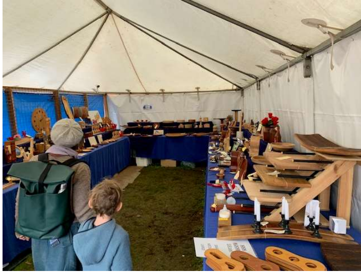
Figure 1 Marquee ready!