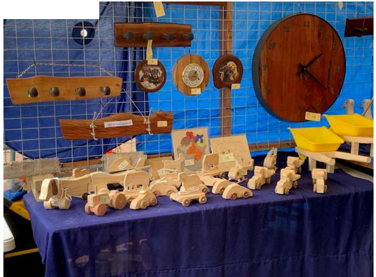
Figure 2 Toys Galore