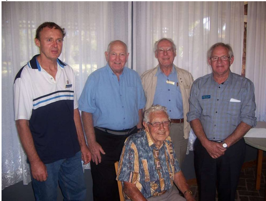
5 of the founding members in 2012