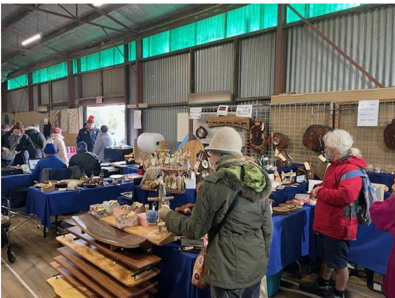
Figure 3 Inside the shed