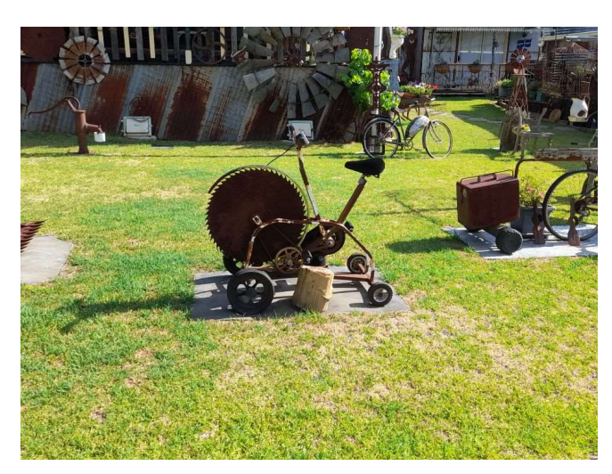
An 'interesting' exercise bike Bruce saw in Sofala NSW

A 'bloke" wanted a panel with this carving – carved in Huon Pine apart from the leaves which are a Western Australia Eucalyptus, the carving took over 40 hours.