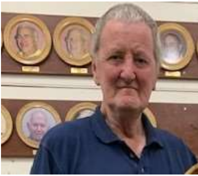
Figure 7 Gary King cut out over 100 Australian animals which were also handed out on the day thank you! Unfortunately, I didn't get a photo of him on the day