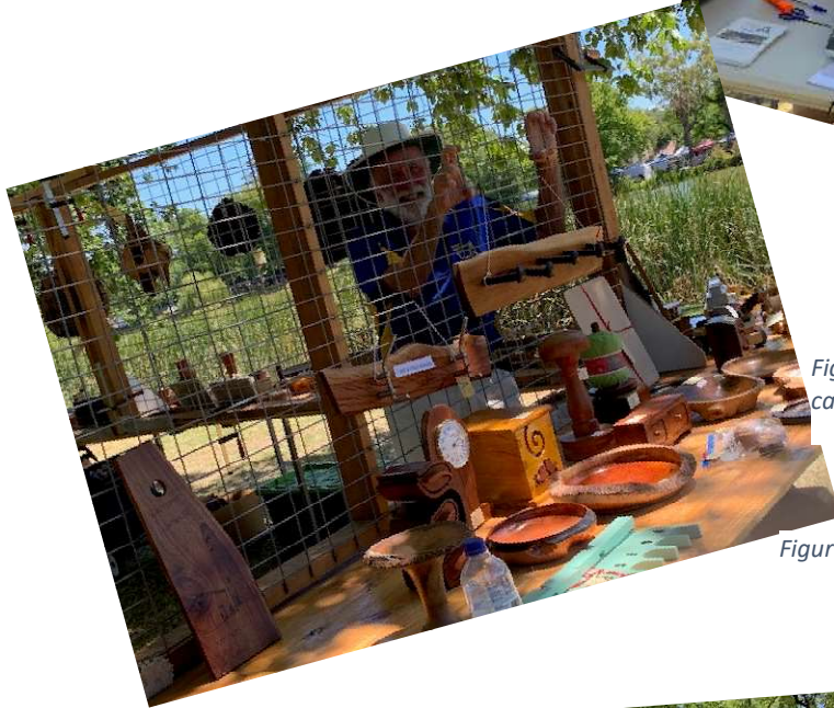
Figure 3 Four wise men?