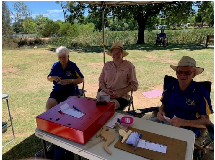
Figure 6 Raffle Sellers