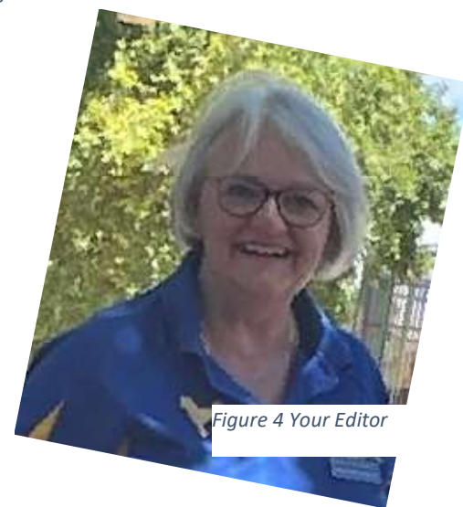
Figure 4 Your Editor