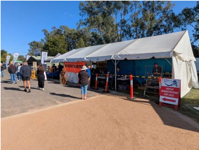
Figure 1 Our set-up