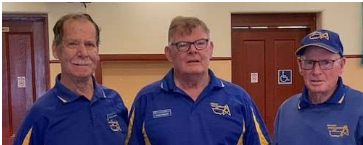
Three Wise Men??