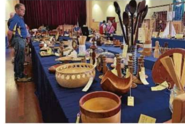
Some of the many items on show at the Bendigo Woodturners Easter Exhibition.