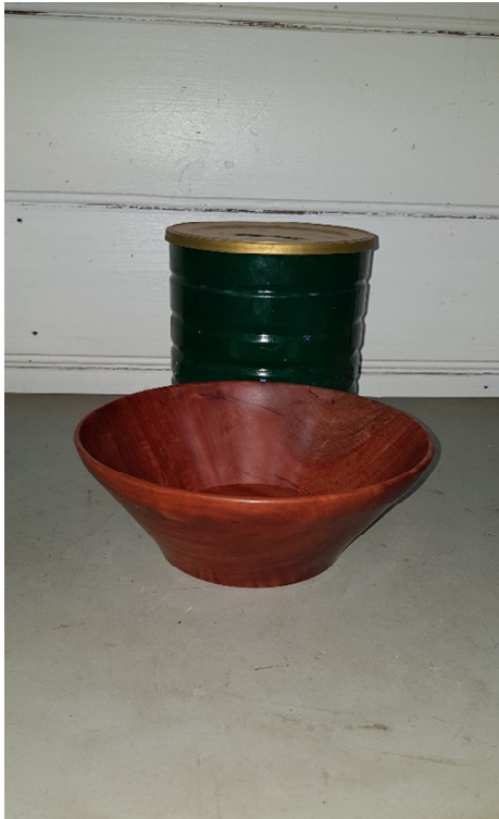
3 rd – Kevin Trevin (redgum bowl)