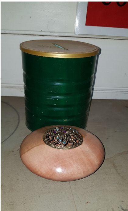
1 st Arthur Curnick (butterfly lidded potpourri container)