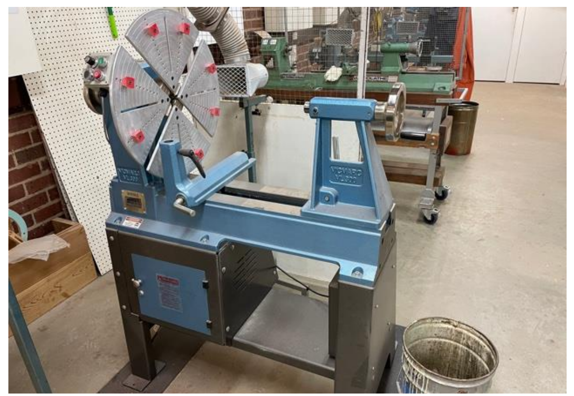
New lathe purchased with most of the cost covered by a government grant