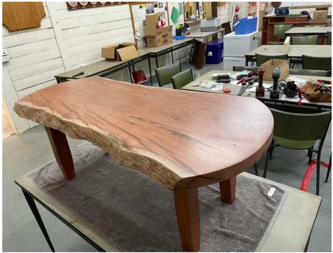
First prize for the Easter Raffle