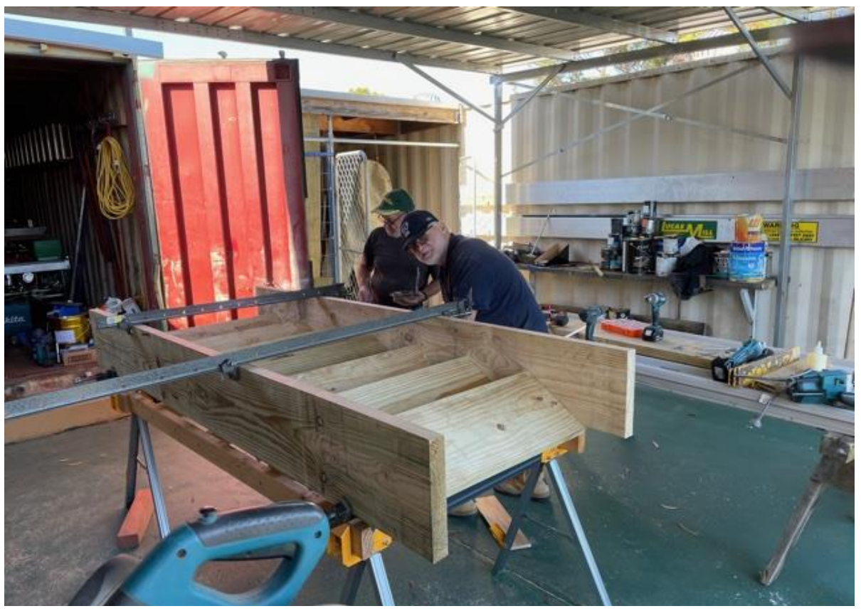
Construction on the new steps