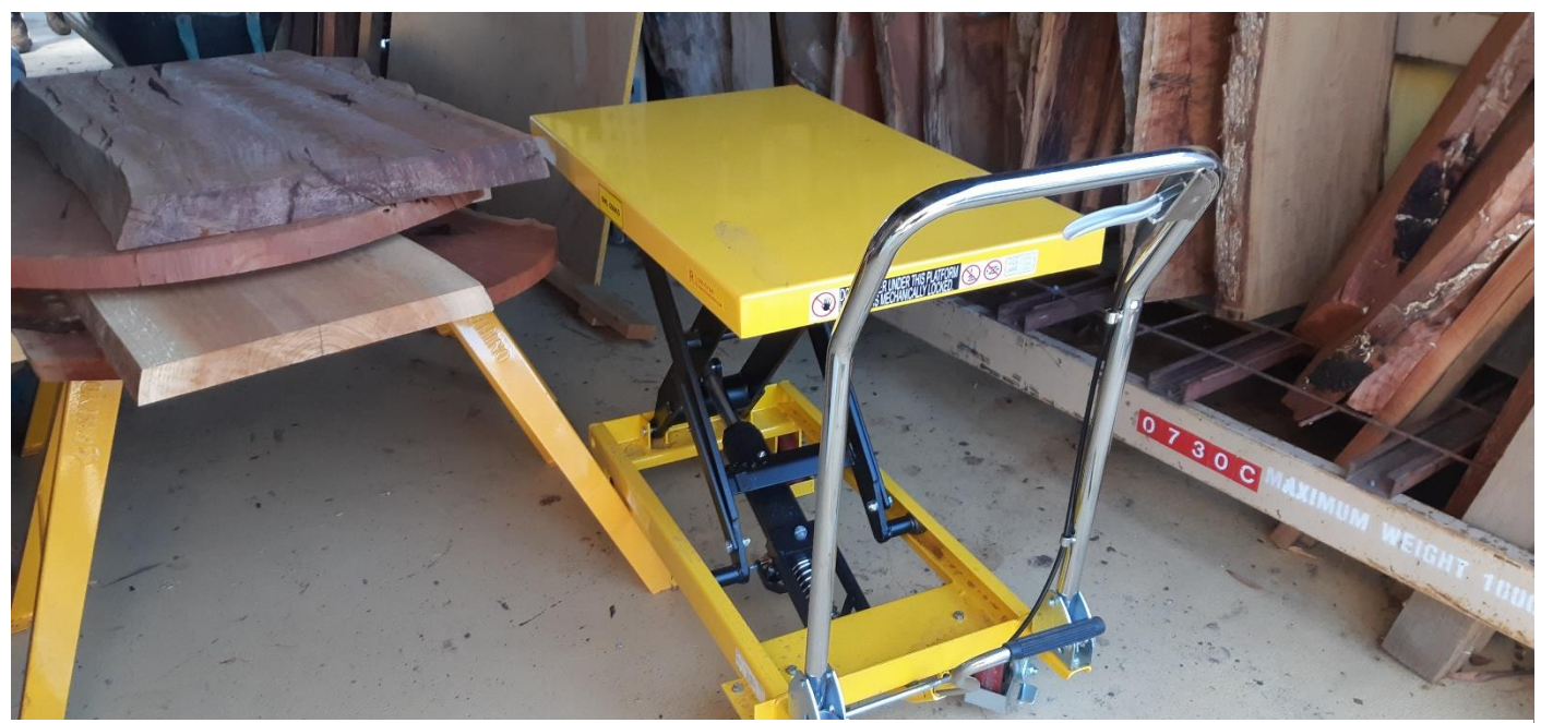
Our latest addition is a hydraulic lifter, kindly donated and supplied by Tools Unlimited.