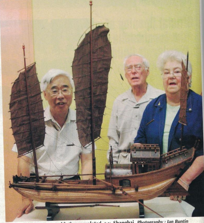
The Restoration Team with the completed s.v. Shanghai

In the Woodwork and Painting factory of Shanghai's notorious HongKou gaol some of these political prisoners occu-