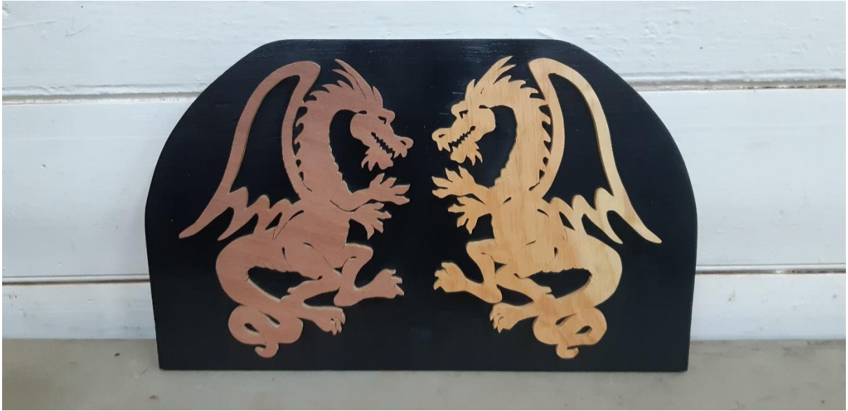
1 st Open – Gladys Chelman