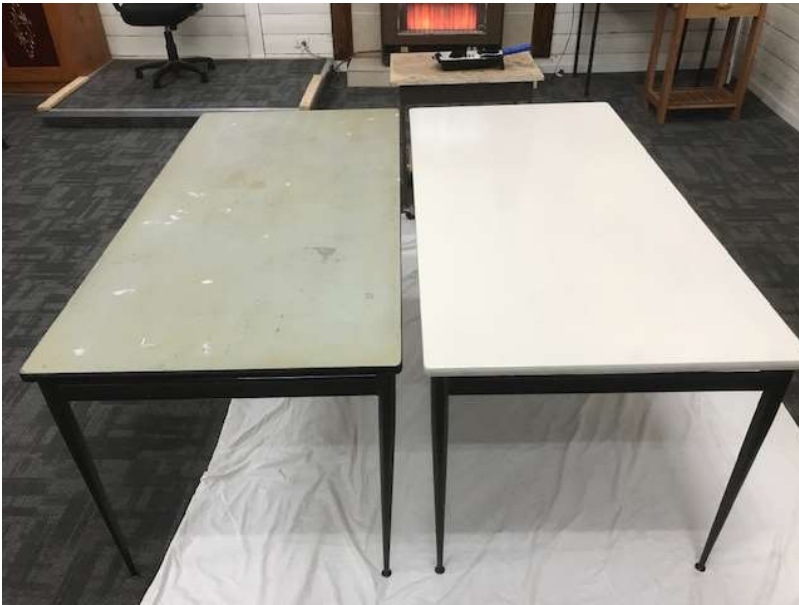
Before & after the tables face lift