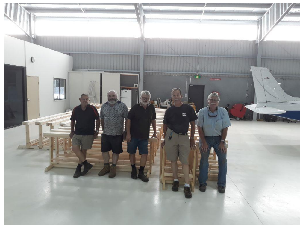
Dragon Stands in Bendigo Airport Hangar awaiting Dai Gum Loong