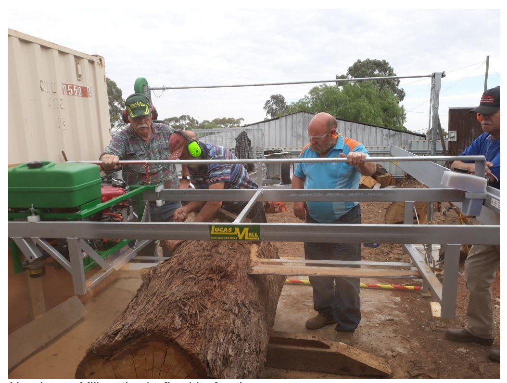
New Lucas Mill getting its first bit of action