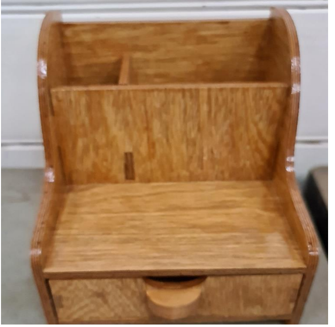
Equal 2<sup>nd</sup> – Maurie Chelman (Card container – quarter ply, French polish)