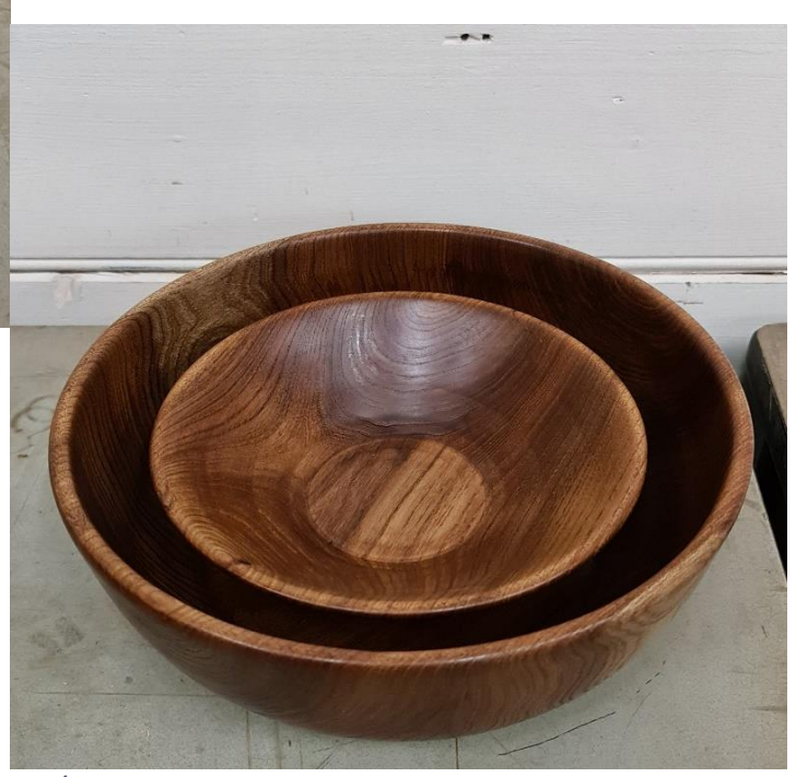
3<sup>rd</sup> – Jim Juffs (Bowls – from same piece of wood)