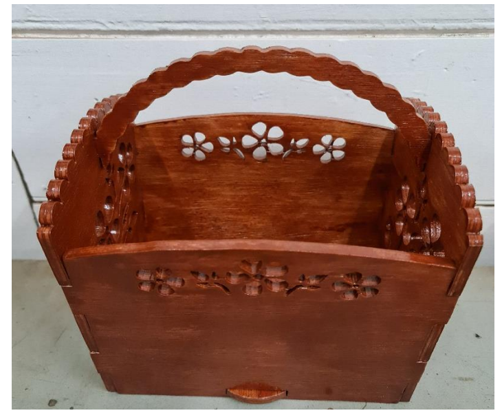
Equal 2<sup>nd</sup> – Gladys Chelman (Scroll work basket – quarter ply, Jarra stain)