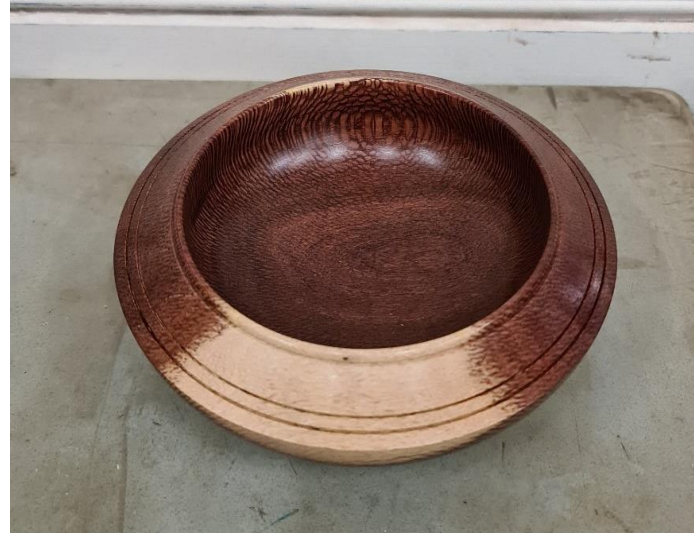
2<sup>nd</sup> – Rosie Kelleher (Bowl – Beefwood, EEE/shellwax)