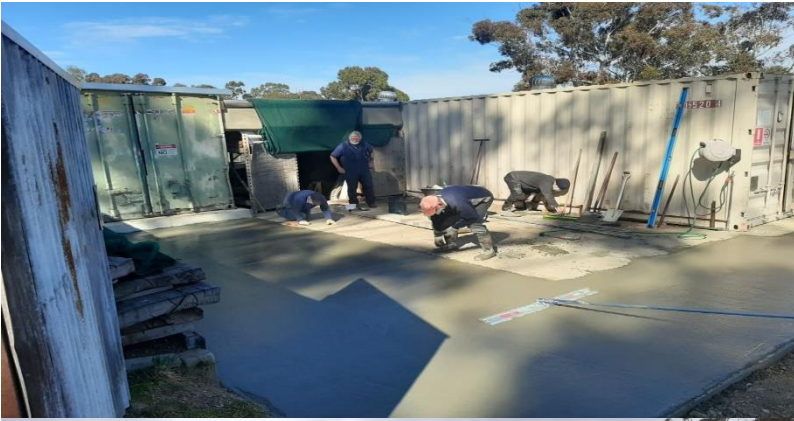
Before December 2020