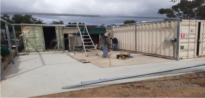
After November 2022