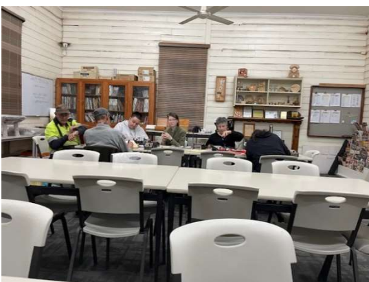
The pyro group is growing. Well done