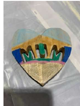
Figure 1 Decorated by a delightful young lad