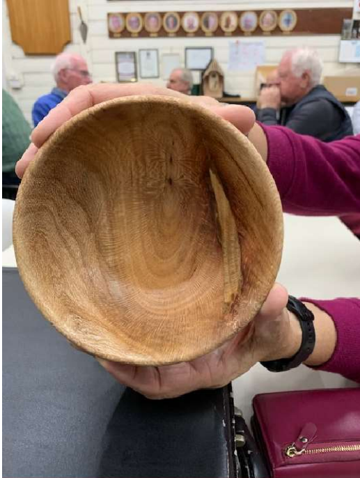
Figure 1 Open Competition - turned bowl in Silky Oak by Jeff Juffs