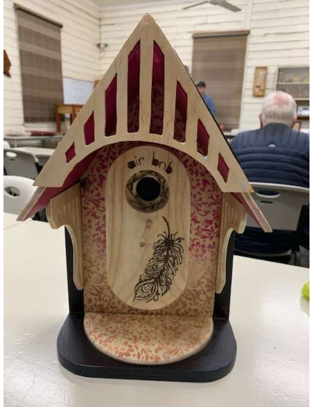
Figure 2 Bird House by Helen Franklin; made from all recycled materials