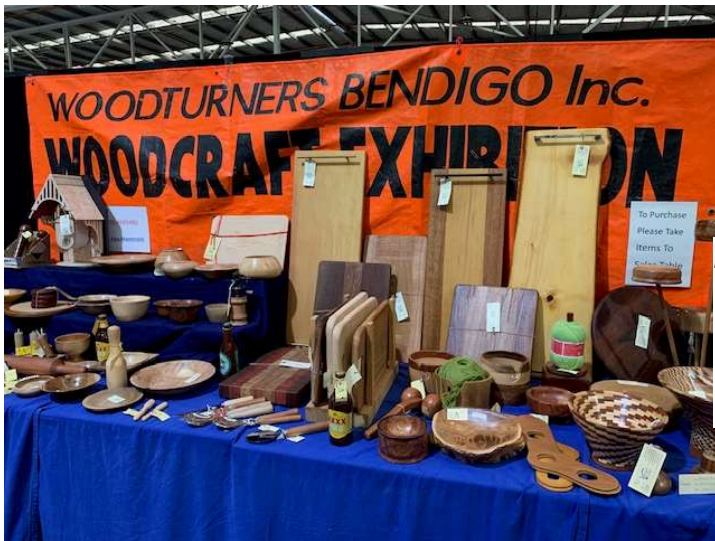
Figure 1 Our set up - small but impressive