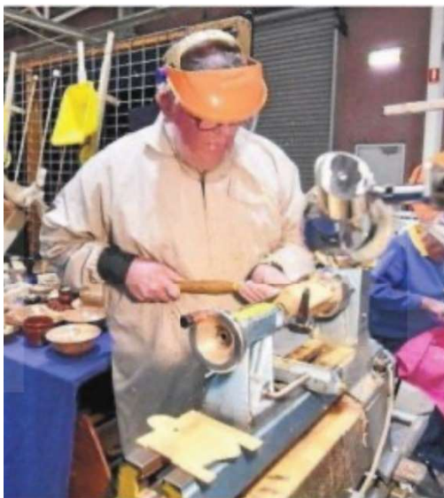
2 Bendigo Advertiser, Monday 16 June