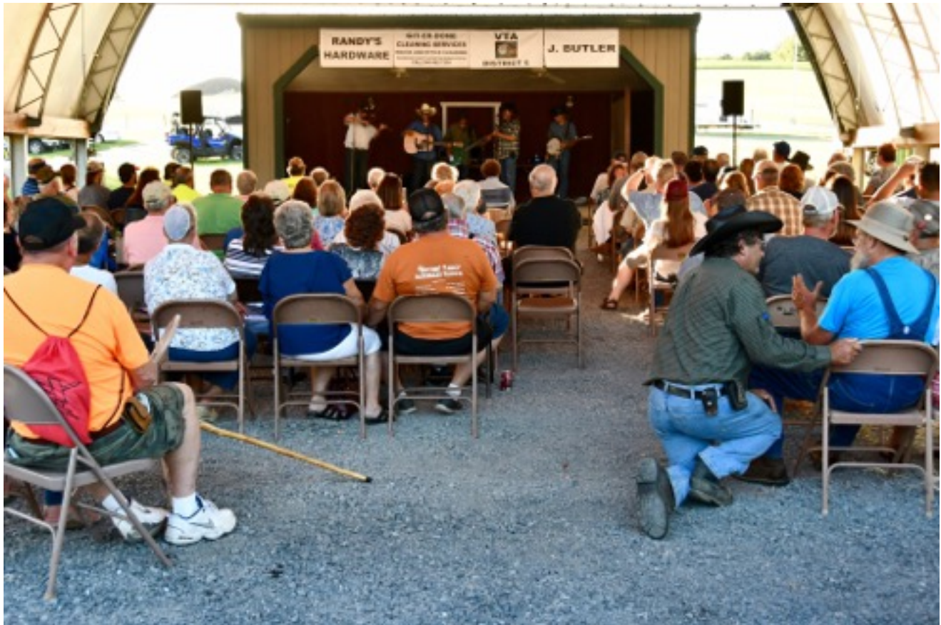
Bluegrass band “Nothin Fancy” help wind down the trappers rendezvous.