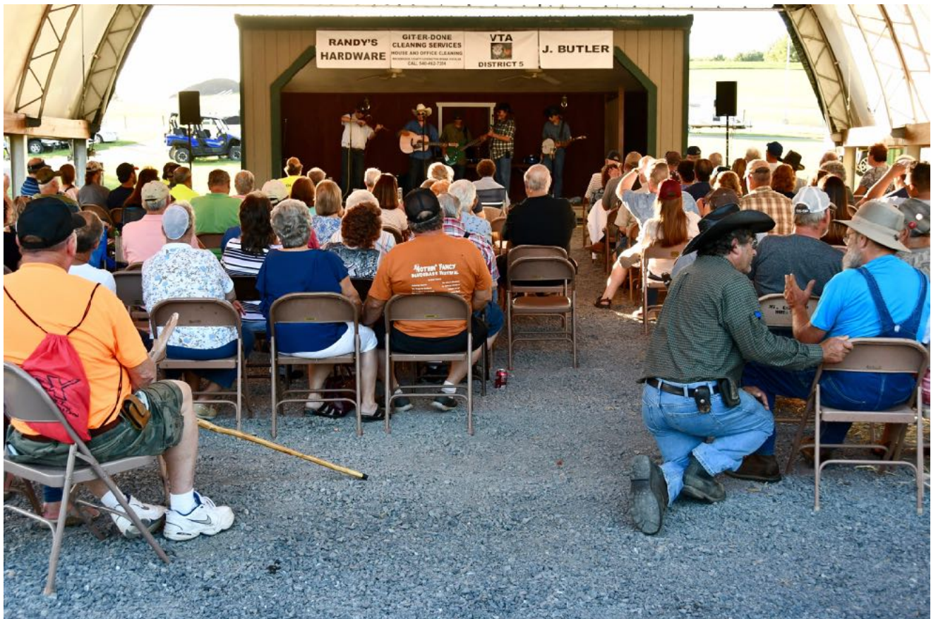
Bluegrass band "Nothin Fancy," helps wind down the trappers rendezvous.