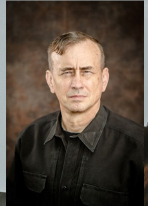
DAVE GROSSMAN LIEUTENANT COLONEL (RET.) UNITED STATES ARMY