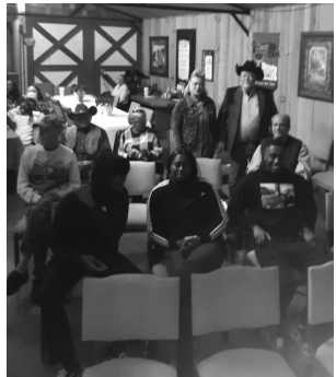
Members of NE Texas Cowboy Church, Hawkins