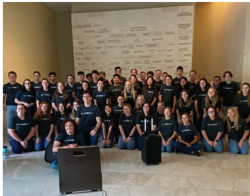
Praise Alive High School Choir, Green Acres Baptist Church

So I ask again, if God opens a door, are you willing to walk through it? Be alert and watchful, the opportunities are always there! Don't miss out on being someone's blessing.