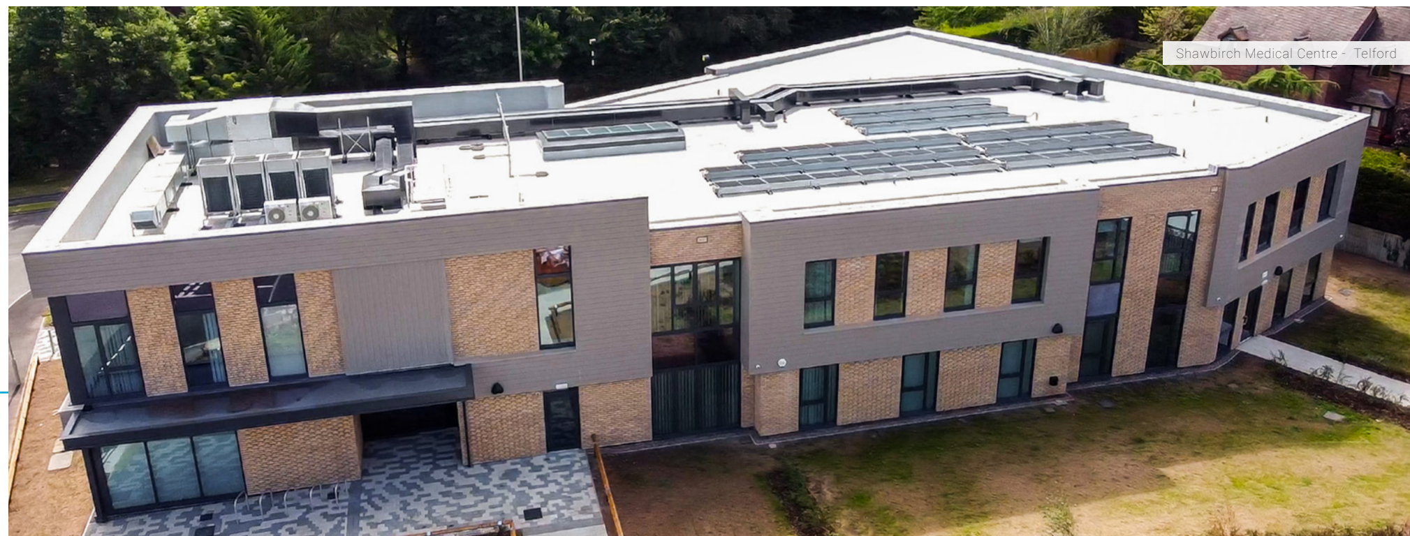
Shawbirch Medical Centre - Telford