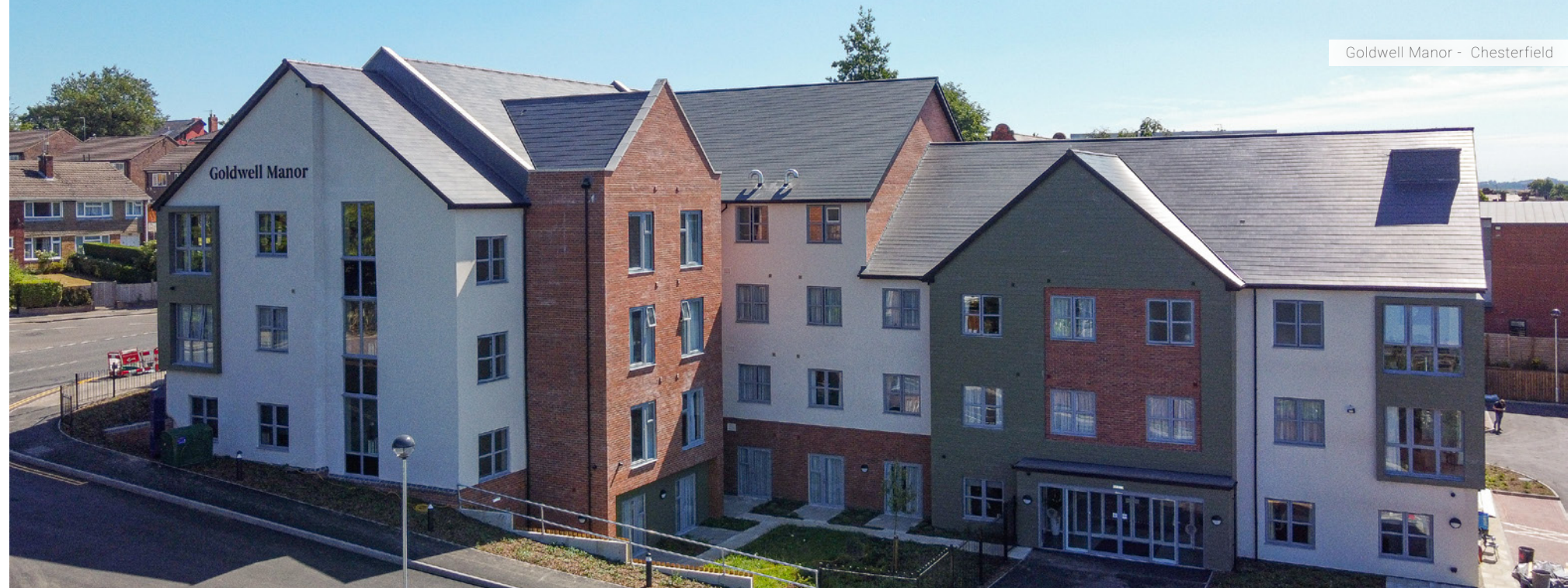
Goldwell Manor - Chesterfield

Once the construction phase of the project has been concluded, we can undertake a Completion Report. This report reviews whether the Developer/ Borrower has completed all the necessary obligations for the scheme including Statutory Authorities and contractual obligations under the Building Contract. ECY can also include an assessment of 'what went well and the scheme and what did not', providing recommendations which can be adopted for future schemes - a 'best practice approach', based upon continuous improvement.