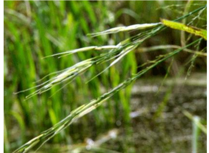
WDNR photo of rice stalk heads