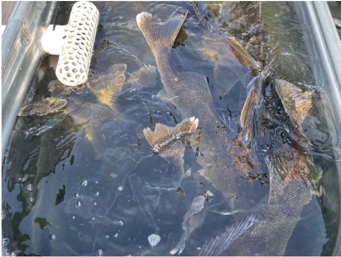
Crane Lake Female Walleyes