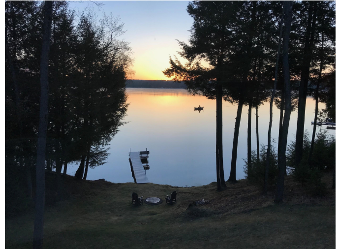
Crane Lake Sunrise

Your attendance at the Spring Lake District Meeting should be very enlightening. Brad Kupfer will give us a presentation on the Lake Management Plan including the results from the survey that we all completed. We