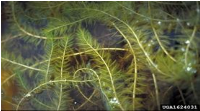
Eurasian Water Milfoil Weed

As you all know, Pickerel Lake has a lot of Eurasian Water Milfoil. While weed harvesting did not cause this, weed harvesting is responsible for some of the spread. Every time a Eurasian Water Milfoil weed is cut, any particle of that weed will sink to the bottom and grow more.