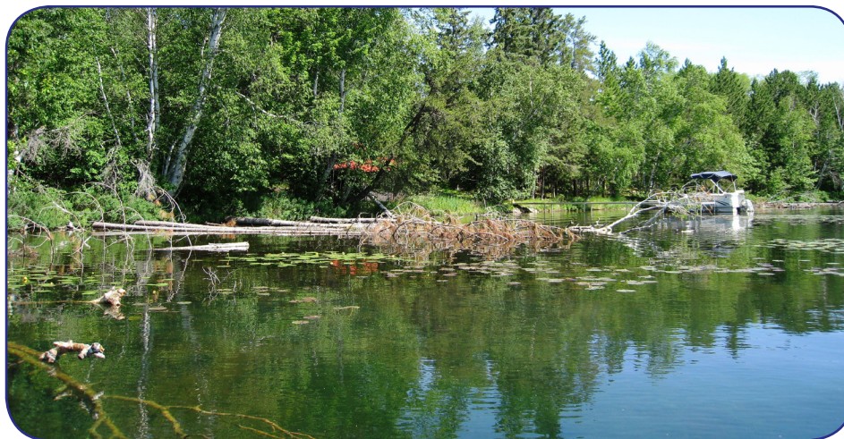
Bony Lake, Bayfield County - Pamela Toshner

FISH STICKS , an in-lake best practice (not eligible for rivers), are large woody habitat structures that utilize whole trees grouped together, resulting in the placement of more than 1 tree per 50 feet of shoreline. Fish Sticks are anchored to the shore and are partially or fully submerged. Fish sticks are not tree drops since the trees utilized for the projects come from further than 35 feet from shore, thus they don't "rob from the bank" of trees that may otherwise grow and fall in naturally.