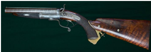
1852 Austrian Flintlock Cavalry Carbine – 13 ¼ inch barrel

http://www.hallowellco.com/historical_gallery_antique%20guns.htm