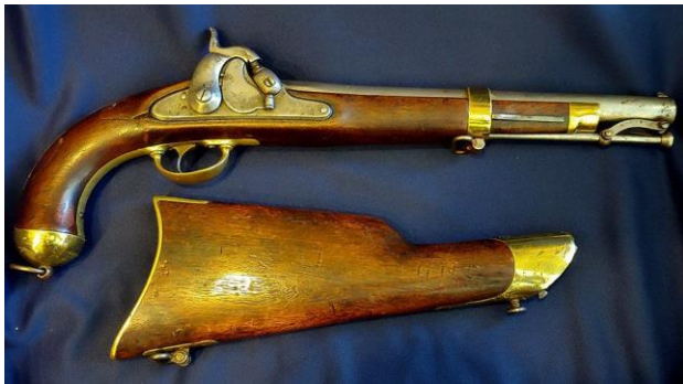
US 1855 Percussion Pistol-Carbine

https://www.liveauctioneers.com/item/71137886_1855-pistol-carbine-and-shoulder-stock