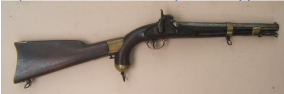
1860 Colt Army Revolver – Stocked Pistol

https://www.ambroseantiques.com/ppistols/us55.htm