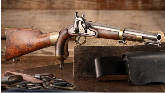
1855 Springfield Pistol-Carbine

https://www.liveauctioneers.com/item/71137886_1855-pistol-carbine-and-shoulder-stock