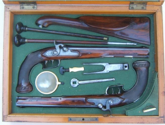
Ca. 1850s Howdah Pistol – with detachable stock

http://www.hallowellco.com/historical_gallery_antique%20guns.htm