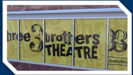
Three Brothers Theater located on Genesee Street in downtown Waukegan.