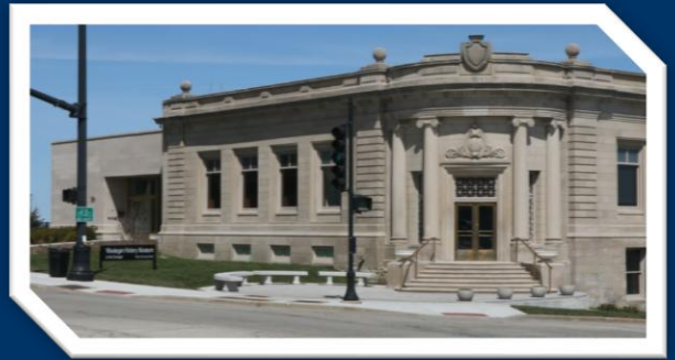
The Waukegan Historical Museum m at the Carnegie Library and the Ray Bradbury Collection