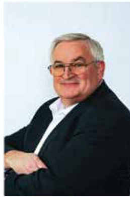
David Furnish Trustee