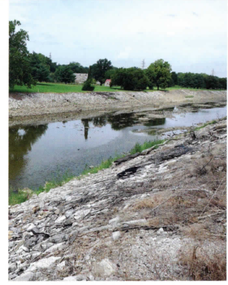
River Des Peres; the straightening and man-made alteration with concrete sides affects the well-being of spring peepers