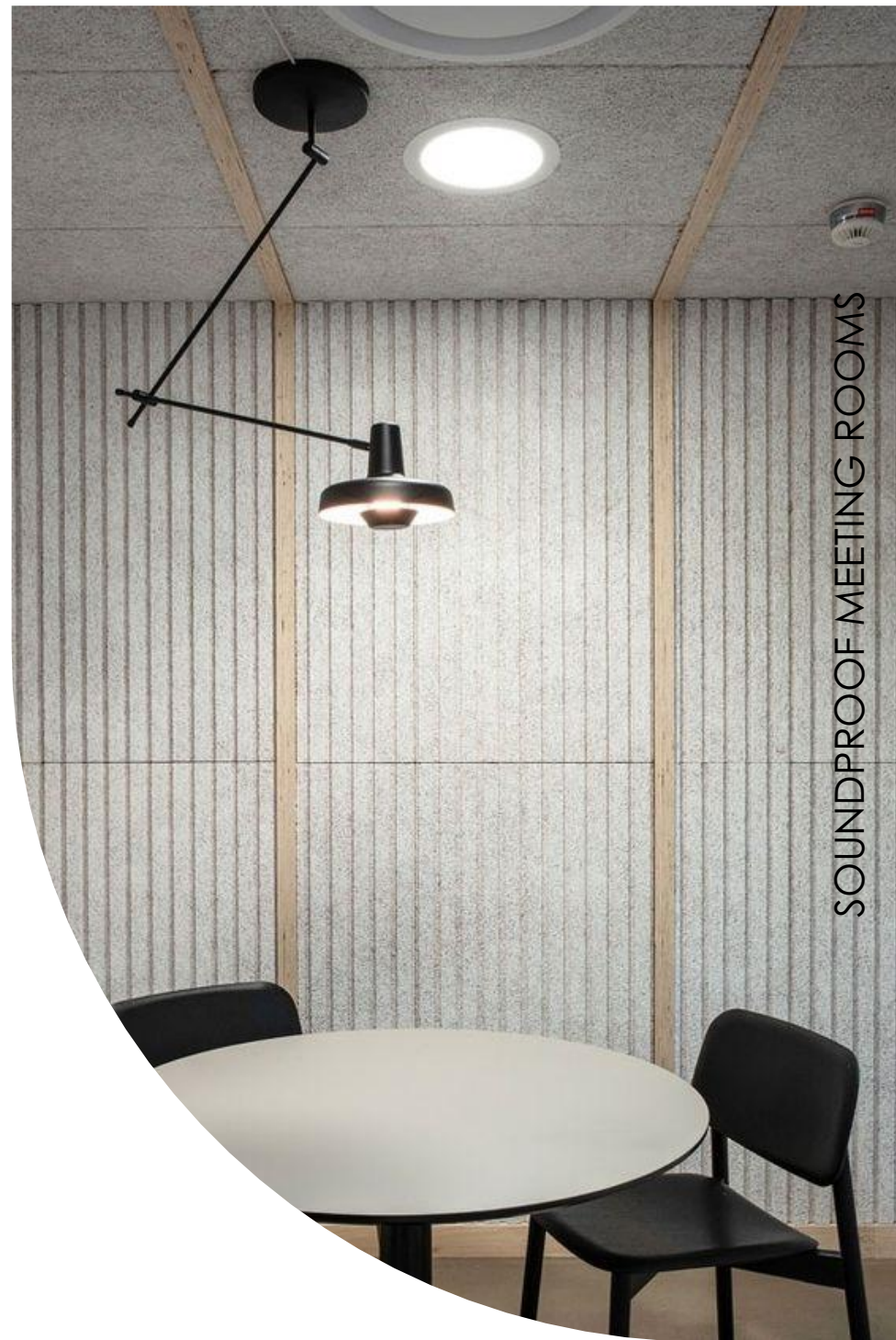
SOUNDPROOF MEETING ROOMS