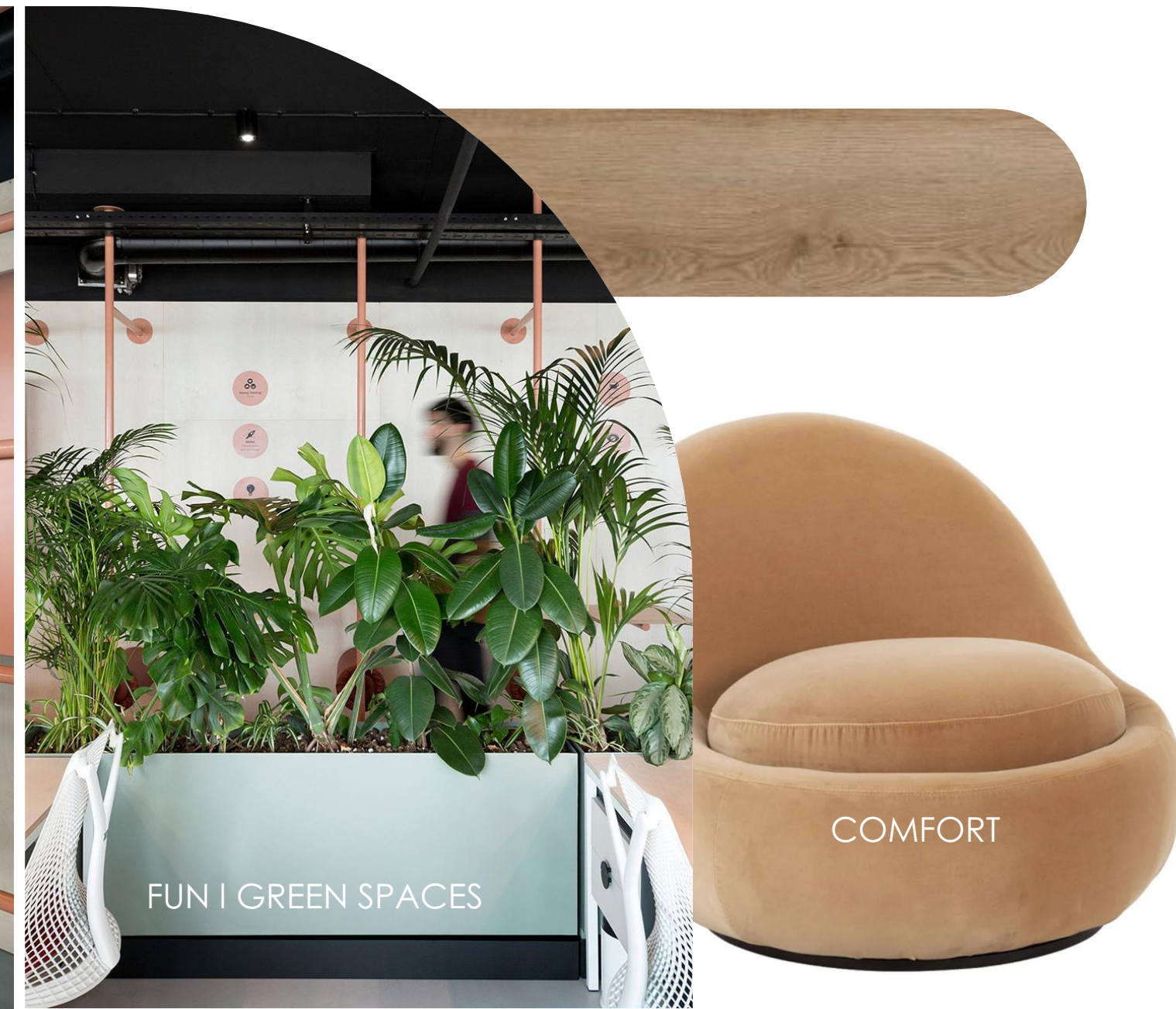
FUN | GREEN SPACES