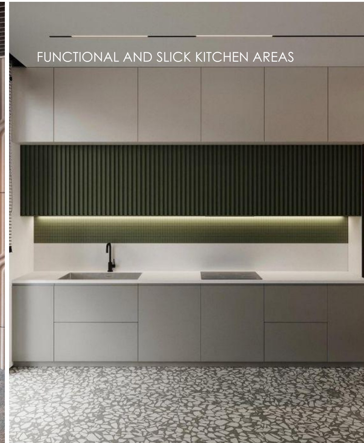
FUNCTIONAL AND SLICK KITCHEN AREAS