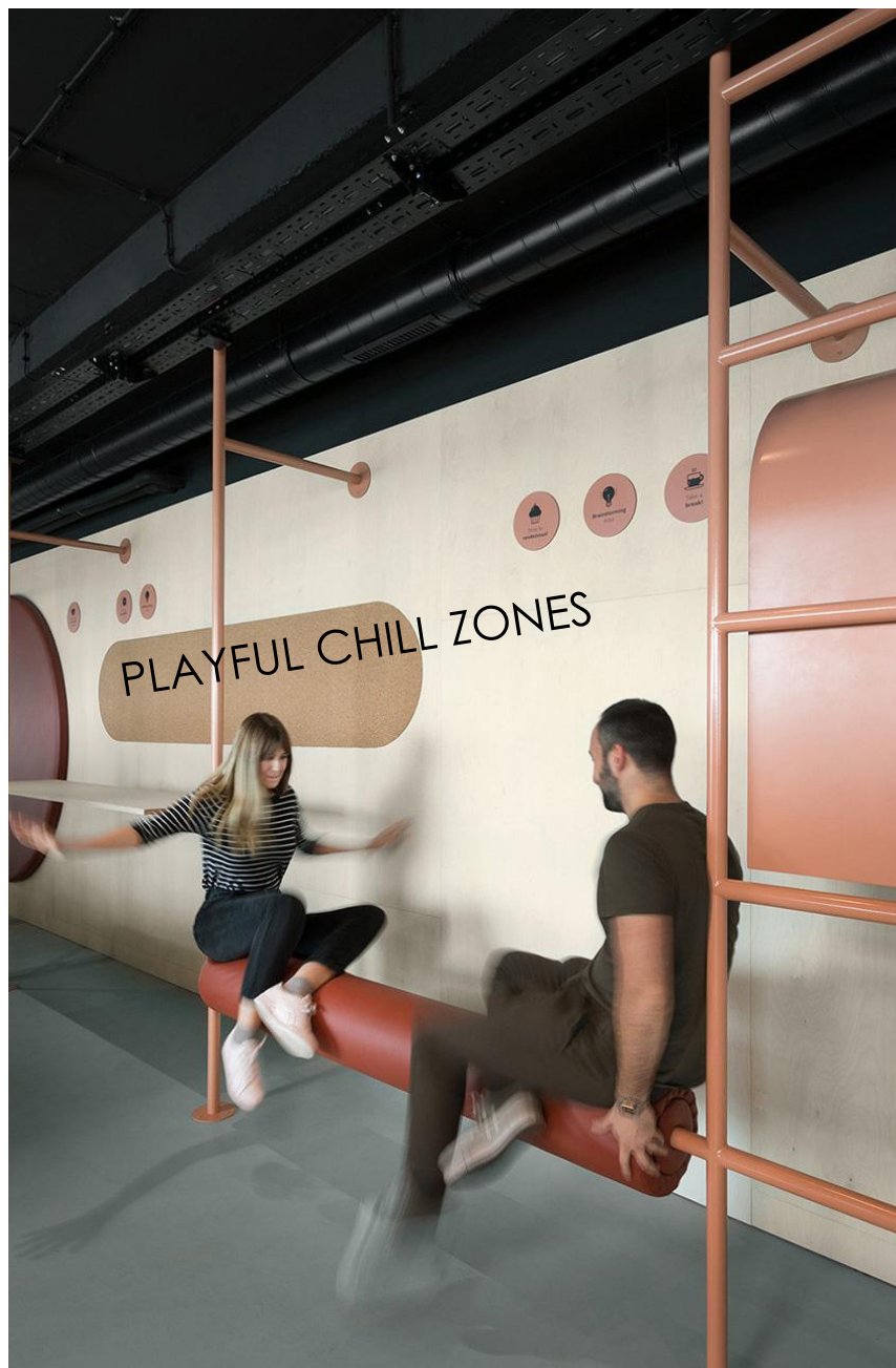
PLAYFUL CHILL ZONES