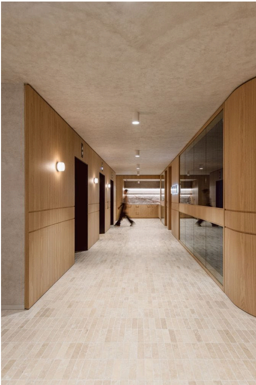
NEAUTRAL LIFT WALL CLADDING