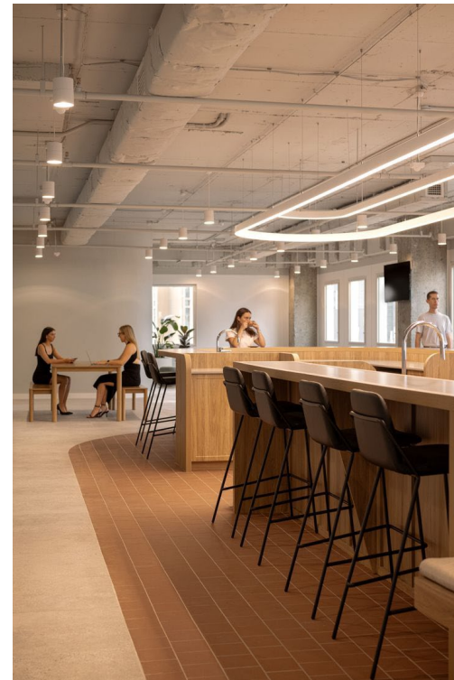
TONAL JOINERY AND EXPOSED CEILING