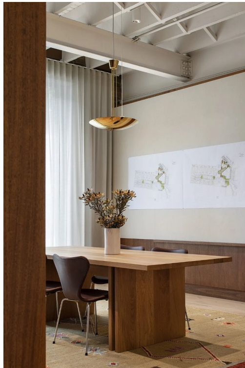
LARGE COMMUNIAL TIMBER TABLES