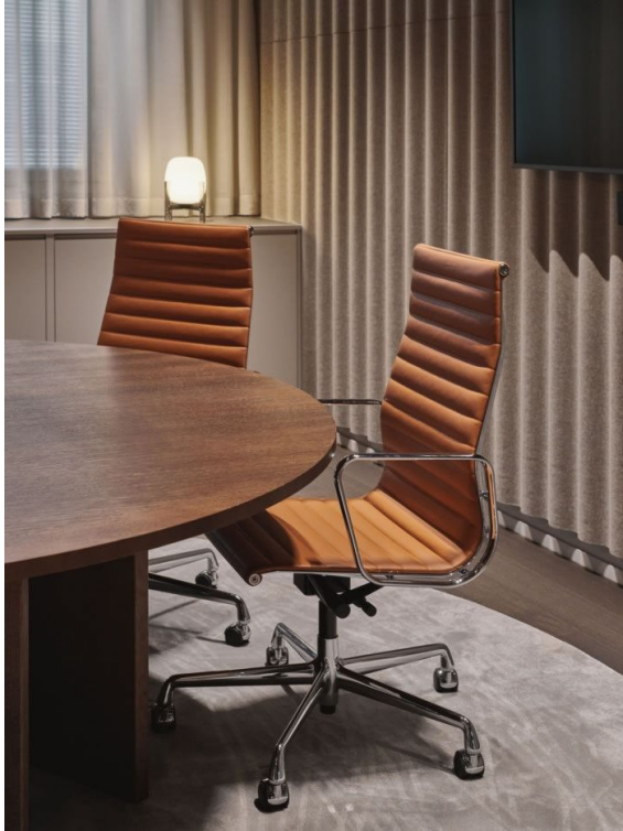
NEUTRAL TONED MEETING ROOMS