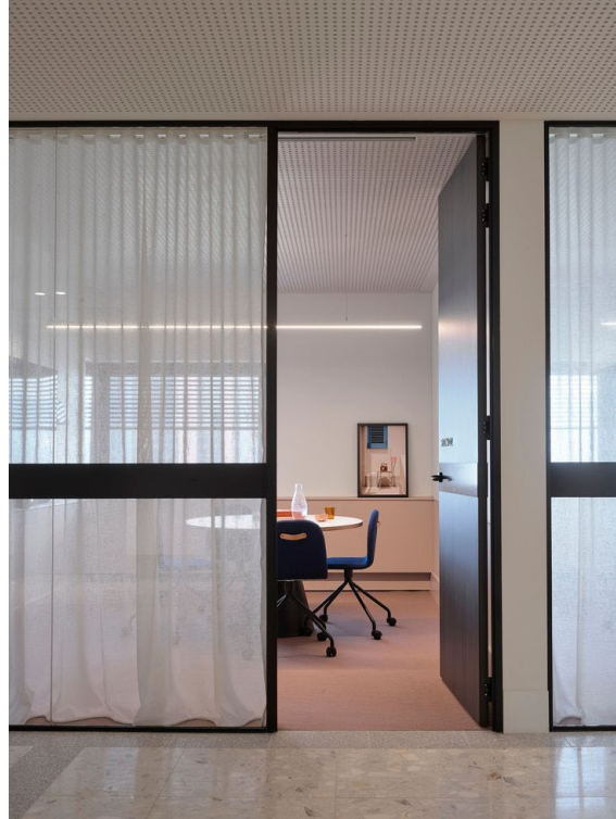
BLACK SOLID GLAZING FILM WITH SLIMLINE GLAZING FRAME