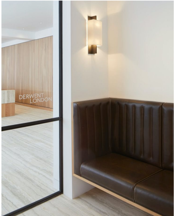
FEATURE WALL LIGHTS