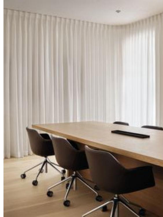
SOFT CURTAINS TO ELEVATE THE LOOK