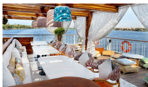
The Chef's Al Fresco Restaurant